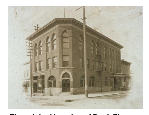
The original location of Bank First on the southwest corner of York and North 8th Streets in downtown Manitowoc.

The bank achieved great financial success during its first 33 years in business, and by 1927 it outgrew its original location. On August 20, 1927, Bank First moved from the southwest corner of North Eighth and York Streets to just across the street on the first floor of the Hotel Manitowoc building at the northwest corner of North Eighth and York Streets (known today as Dali's Café). The new bank building had a state-of-the art security system and a very elaborate interior. The nameplate of the bank was