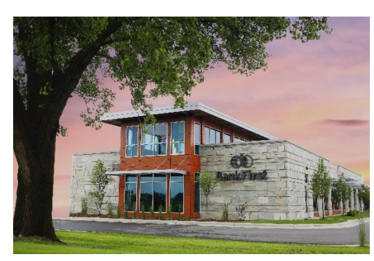
Today, Bank First's offices feature a contemporary design and efficient use of space, allowing the bank to provide exceptional service in a more customer friendly environment.

Today, Bank First has assets in excess of $1.8 billion and operates out of 19 locations throughout Wisconsin. It has become one of the top performing financial institutions in the State of Wisconsin. Bank First attributes its success to attracting and retaining top talent who are committed to excellence and adhering to the principles of the bank's promise: "We are a relationship-based community bank focused on providing innovative products and services that are value driven".